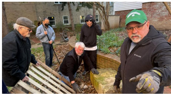
Fourteen members and friends volunteered for projects including decluttering, which never ends, chair repairs, gumball removal, composting, sandstone preparation for courtyard removal, kitchen and bride's room clearing, sump cleaning, electrical system evaluation and fellowship with an out of state family with a son enrolling in Marietta College.